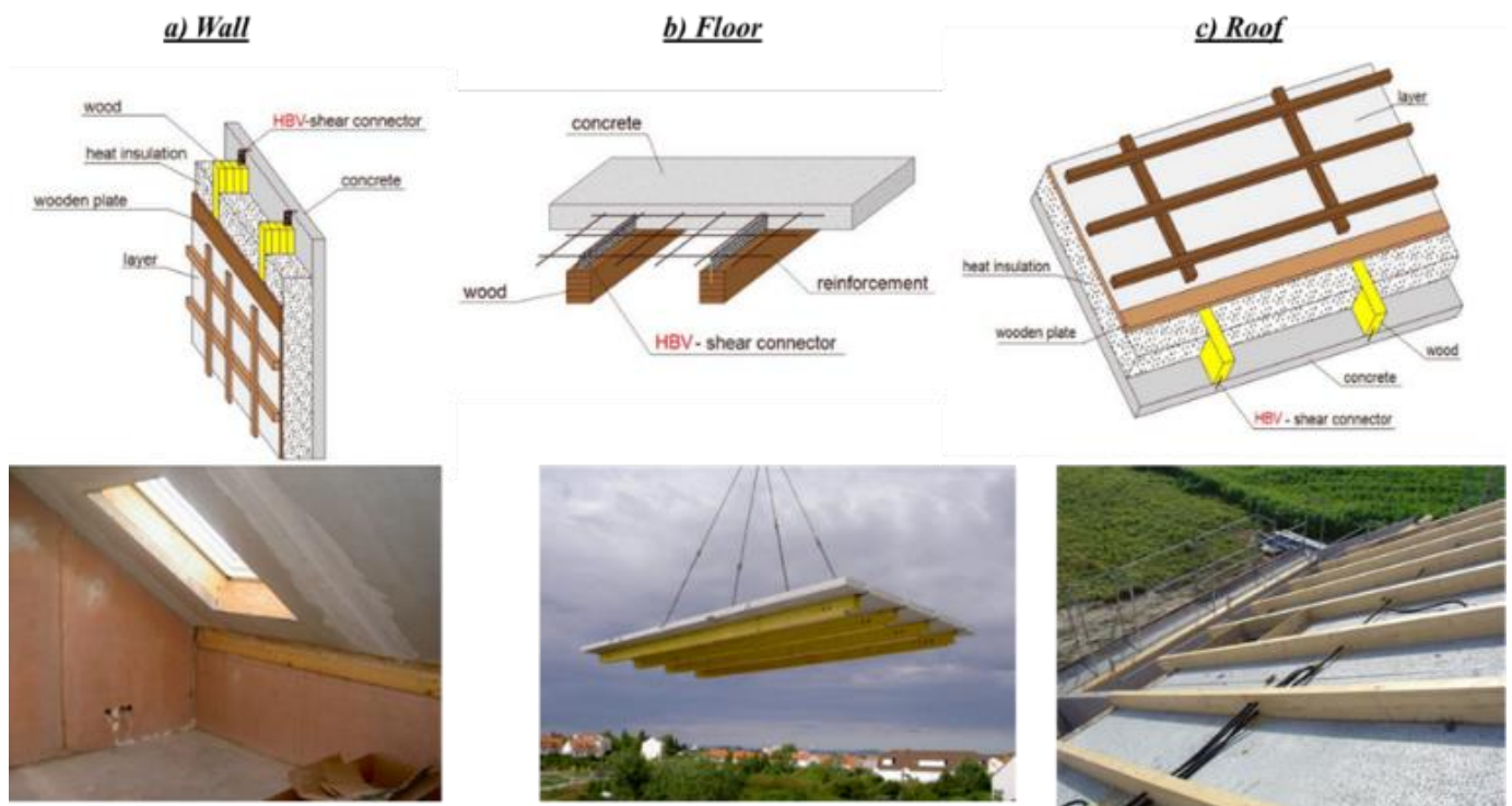
Fig. 6 Timber-concrete-composite panels used in a building (Bathon, Bletz, & Schmidt, 2006)

Reardon (1990) reports test results of a simulated cyclone wind loadings on a steel framed single storey house constructed using prefabricated panels. The lateral and uplift load distribution on the panels were evaluated and the results demonstrate that the structure responded well for a static load simulation up to 50 ms -1 wind force. However, when simulated to the cyclonic condition including cycling and fluctuating wind loads, failure of wall panels was observed. The failure was induced by the fatigue of the rods in the eccentric connections of the building.