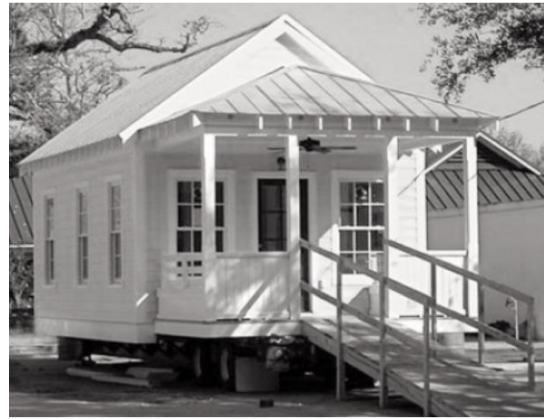
Fig. 5 The original 'Katrina Cottage' design that was used to cater the housing demand which followed the Hurricane Katrina disaster in 2005 (Gunawardena, Ngo et al. 2014)

Bathon et al. (2006) present findings on the structural response of a modular building fabricated by timber-concrete-composite panels (Fig 6). Hurricane wind forces up to 400 km/h were induced on the developed structure and the results highlight the significance connections between modular components used in the building. The floor level lateral load of the building was 429 kN/m, and the stability of the structure was facilitated through the wood-concrete-composite panels. Moreover, in comparison with conventional buildings, it is identified that the proposed panel system design is cost effective. The composite panel design of the modular structure delivers enhanced resilience against lateral loads induced by winds and earthquakes when compared to typical building structures (Abu-Zidan, Mendis, Gunawardena, Mohotti, & Fernando, 2022).