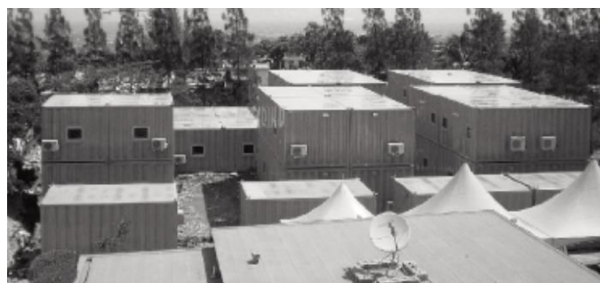
Fig. 4 Modular housing units installed by the Canadian Embassy in Haiti (Gunawardena, Ngo et al. 2014)

A series of studies (Annan, Youssef et al. 2007, 2008, Annan, Youssef et al. 2009, Annan, Youssef et al. 2009) evaluated the elastic performance of modular steel braced frames vertically connected by field welding subjected to seismic loads. Factors and components such as ceiling beams, eccentricity at the joints of the braces and provisions on rotation between neighboring columns of the module enabled through semi-rigid welded connections, illustrated remarkable differences in the seismic response between modular and regular steel braced frames. Further, the studies emphasized the design significance of specific detailing in modular steel building braced systems to improve performance under seismic loads. Similar conclusions are drawn in Savoia, et al. (2017) based on the 2012 Emilia earthquake in Italy. In the analysis of a prefabricated modules based flexible structural system, Gunawardena et al. (2016) modeled a 20-story modular building using ETABS software. The model was subjected to nonlinear earthquake time-history analysis allowing for geometric and material nonlinearities, that may occur because of severe dynamic loads. Maximum storey drifts of 0.13% and 1.20% were recorded for static and dynamic analyses respectively. Although the resulting drift values were within the permissible range, the study recommended further investigations into redundancy and failure mechanisms.