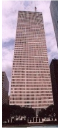
Fig. 5 - One Shell Plaza in Houston