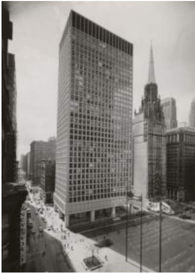
Fig. 4 - The Brunswick Building in Chicago