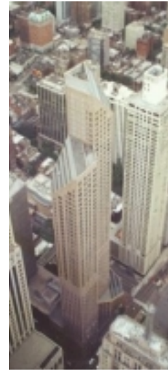
Fig. 6 - One Magnificent Mile building in Chicago

Choosing a structural system is very complex in today's market. In the years of the Ingalls Building, one system of post-and-beam construction existed. Concrete's formwork was complex but putting the building together was not as complex as today's systems. Developments in the world of concrete since 1960 have been mostly in new systems such as the tubes and composite construction. The challenge for engineers and architects today is to make all the systems work together to their maximum capacity and create a habitable environment for the people within the built structure.