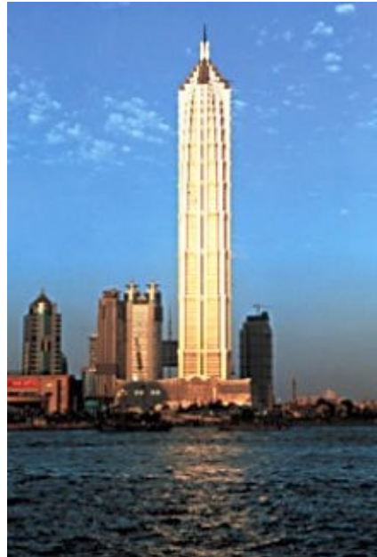
Fig. 10 - The Jin Mao building

Two more recent buildings constructed around the turn of the 20th century where concrete has been primarily used as the structural material in conjunction with steel are the Petronas Towers (Fig. 9) in Kuala Lumpur, Malaysia (currently the tallest building in the world) and the Jin Mao building (Fig.10) in Shanghai, China. These are good examples to show that concrete has greatly advanced as a material in a century since the days of Ingalls Building construction. The