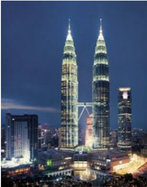
Fig. 9 - Petronas Towers

One Peachtree Center, built in 1991 in Atlanta, Georgia, is a 62-story, 842 ft.(257 m) tall, bundled-tube design with three strengths of concrete used in its columns and shear walls-- 8,500, 10,000 and 12,000 psi (58.6, 68.9 and 82.7 MPa). Designers used technology developed in the 1960s and 1970s by Material Service Corporation in Chicago. Architectural requirements dictated a column-free interior and thus a 50-ft (15.2 m) floor span was accomplished with HSC and post-tensioned steel bars. Silica fume and granite aggregates were used to achieve the necessary strengths. Of special note for the owner of the building, each floor has about 36 rentable corner offices. This building is remarkable because of its design allowing multiple desired spaces for renters, the structural design and its desired use of Chicago style high-strength concrete.