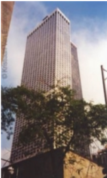
Fig. 7 - The Water Tower Place

The Water Tower Place (Fig.7) became yet another high-rise structure of concrete located in the downtown area of Chicago. Designed in 1975 by Loeb, Schlossman, Dart & Hackl, it stands 859 ft.(262 m) in height and serves as another mixed-use building with a mall on the interior, offices and apartments above. The strength of concrete used in this building took a dramatic jump to as high as 9,000 psi (62.1 MPa). This was, however, only one of eleven mixes placed by six cranes. Mix strengths could vary from 3,000 psi (20.7 MPa) for slabs to 9,000 psi (62.1 MPa) for columns. This building demonstrates concrete technology's ability to rival that of steel for tall buildings as it was 2/3 the height of the tallest steel building of the time. The structural system for Water Tower combines "reinforced concrete peripheral framed tube, interior steel columns, and a steel slab system with a composite concrete topping."