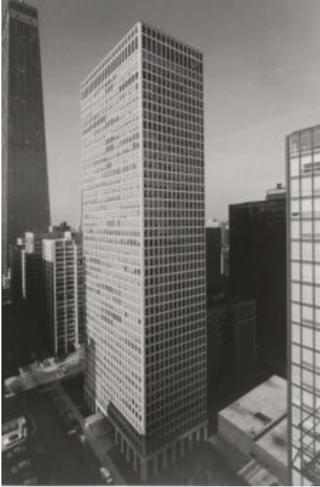
Fig. 2 - DeWitt-Chestnut Apartment building in Chicago

are advantageous for resisting lateral loads in a three-dimensional structural space. Window openings usually cover about 50% of exterior wall surface. Larger openings such as retail store and garage entries are accommodated by large transfer girders, albeit disrupting the tubular behavior of the structure locally at that location. The tubular concept is both structurally and architecturally applicable to concrete buildings as is evident from the DeWitt-Chestnut Apartment building (Fig. 2) in Chicago completed in 1965, the first known building engineered as a tube by Khan.