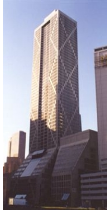
Fig. 3 - The Ontrie Center in Chicago